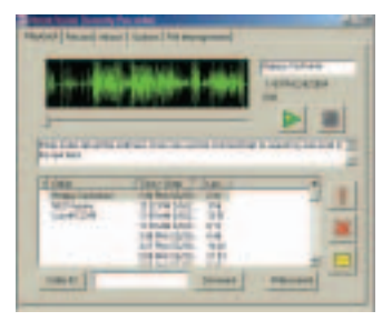
Voice Security Recorder Screen

to 14 different status windows. Customized reports may be created, but the template for a report may not be saved.